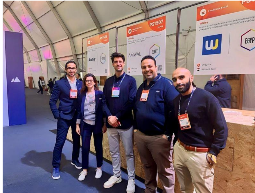
Egyptian founders showcasing tech solutions at Web Summit 2023.

An annual fixture on ITIDA’s calendar – and indeed the calendars of global tech giants, innovative entrepreneurs, and investors alike – was of course Web Summit 2023. Held in sunny Portugal, Egypt’s ICT, GBS, BPO, and startup industries took center stage at the unforgettable edition of the event. Not only did ITIDA represent Egypt with a country pavilion, designed as a one-stop-shop for business leaders to delve into the country’s endless opportunities, but we also took the chance to spotlight an excellent array of local startups and entrepreneurs on a global stage. Founders from an impressive 33 Egyptian startups had the ‘Startup Island’ buzzing, as they showcased their innovative companies and, by extension, the massive potential of young, Egyptian talents.